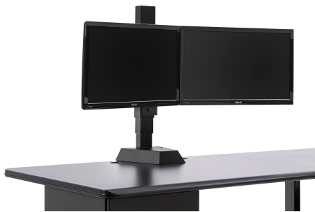
ComfortView™ L2 Monitor Mount

XL or dual display monitors such as Barco Fusion monitors account for two monitor spaces (as seen in the middle monitor above)