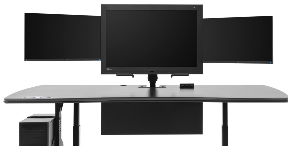
ComfortView™ L4S Monitor Mount