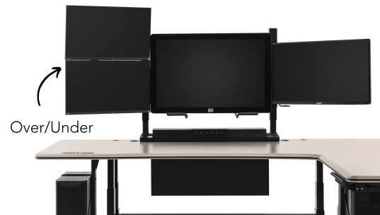
ComfortView™ L4 Monitor Mount