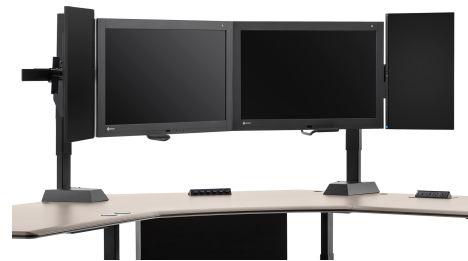
ComfortView™ L6 Monitor Mount