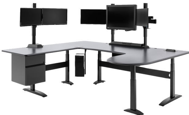
L4 Monitor Mount